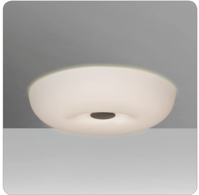
OPAL MATTE (NIMBUS1007C)

UL or ETL Listed. Suitable for Damp Locations (interior use only).